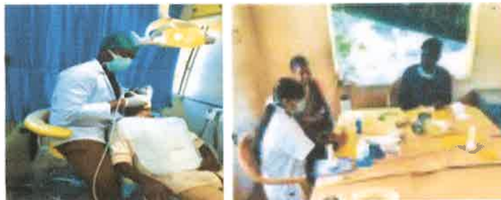
The Department of Public Health Dentistry conducted a Dental awareness program for school students and teachers at Children's Home, Kadapakkam on 07.02.2020. Oral hygiene instructions and Brushing Technique was demonstrated through educational models.