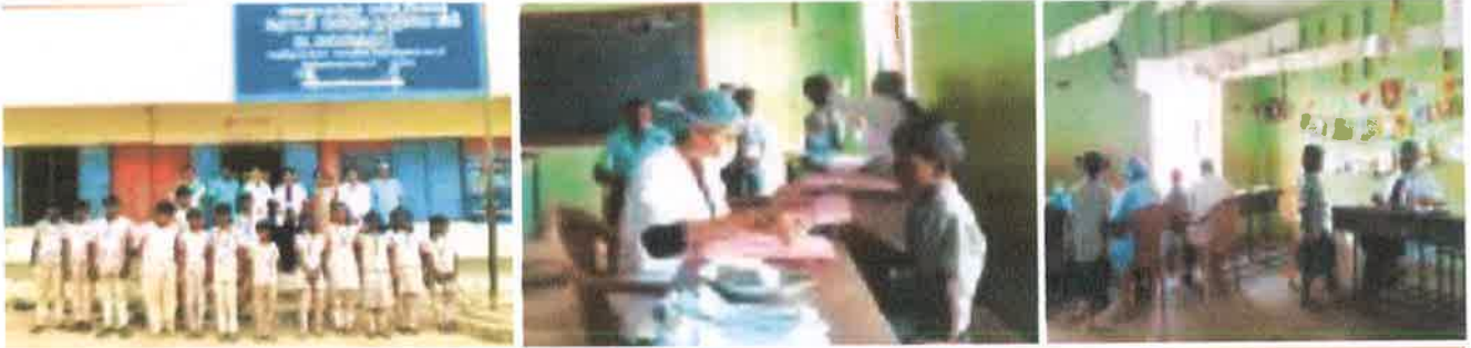
The Department of Pediatric and Preventive Dentistry had conducted Dental awareness program 24.02.2020 at Panchayat Union Middle School, Kadamalaiputhur, Chengalpattu District.