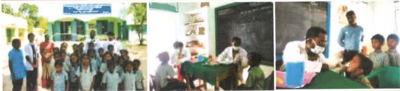
The Department of Pediatric and Preventive Dentistry had conducted an Dental awareness program and treatment camp at Panchayat Union Primary School, Keezh Minnal, Kanchipuram District and at Panchayat Union Middle School, Minnal Chithamoor, Kanchipuram District on 26.02.2020.