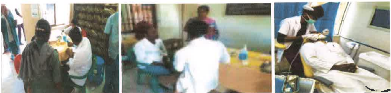
The Department of Public Health Dentistry conducted a Dental awareness program at Uluru health centre, Kadapakkam on 29.01.2020. Pamphlets illustrating proper brushing technique were distributed.